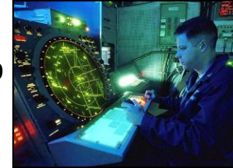
Air Traffic Controller